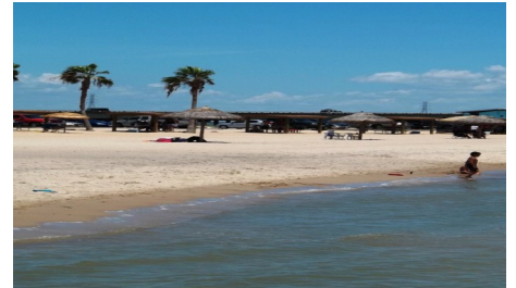
New umbrellas at Lighthouse Beach Park

The Parks Department has been very busy with the upgrades at the Lighthouse Beach R.V. Park. The boardwalk had repairs completed and 500 tons of sand was brought in for the beach area. New restrooms were completed; new showers were installed in the campers recreation room; new cabanas and umbrella huts were installed on the beach; and palm tree showers were installed on the beach for rinsing off.